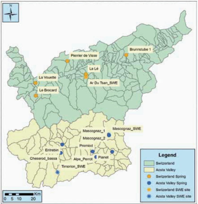
Figure 1: Map of the project area between Regione Valle d'Aosta, Italy, and Canton Valais, Switzerland. Five Swiss and eight Italian springs in various hydrogeological settings were investigated for the spatiotemporal analysis of spring behaviour in mountain areas. Monitored parameters are: discharge [l/s], temperature [°C], and electrical conductivity [µS/cm]. Detailed analysis in three catchment basins (one in Switzerland and two in Italy) has been conducted for studying the effect of snow cover on spring discharge.