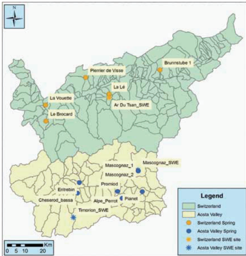
Figure 1: Map of the project area between Regione Valle d'Aosta, Italy, and Canton Valais, Switzerland. Five Swiss and eight Italian springs in various hydrogeological settings were investigated for the spatio-temporal analysis of spring behaviour in mountain areas. Monitored parameters are: discharge [l/s], temperature [°C], and electrical conductivity [ \mu\text{S}/\text{cm} ]. Detailed analysis in three catchment basins (one in Switzerland and two in Italy) has been conducted for studying the effect of snow cover on spring discharge.